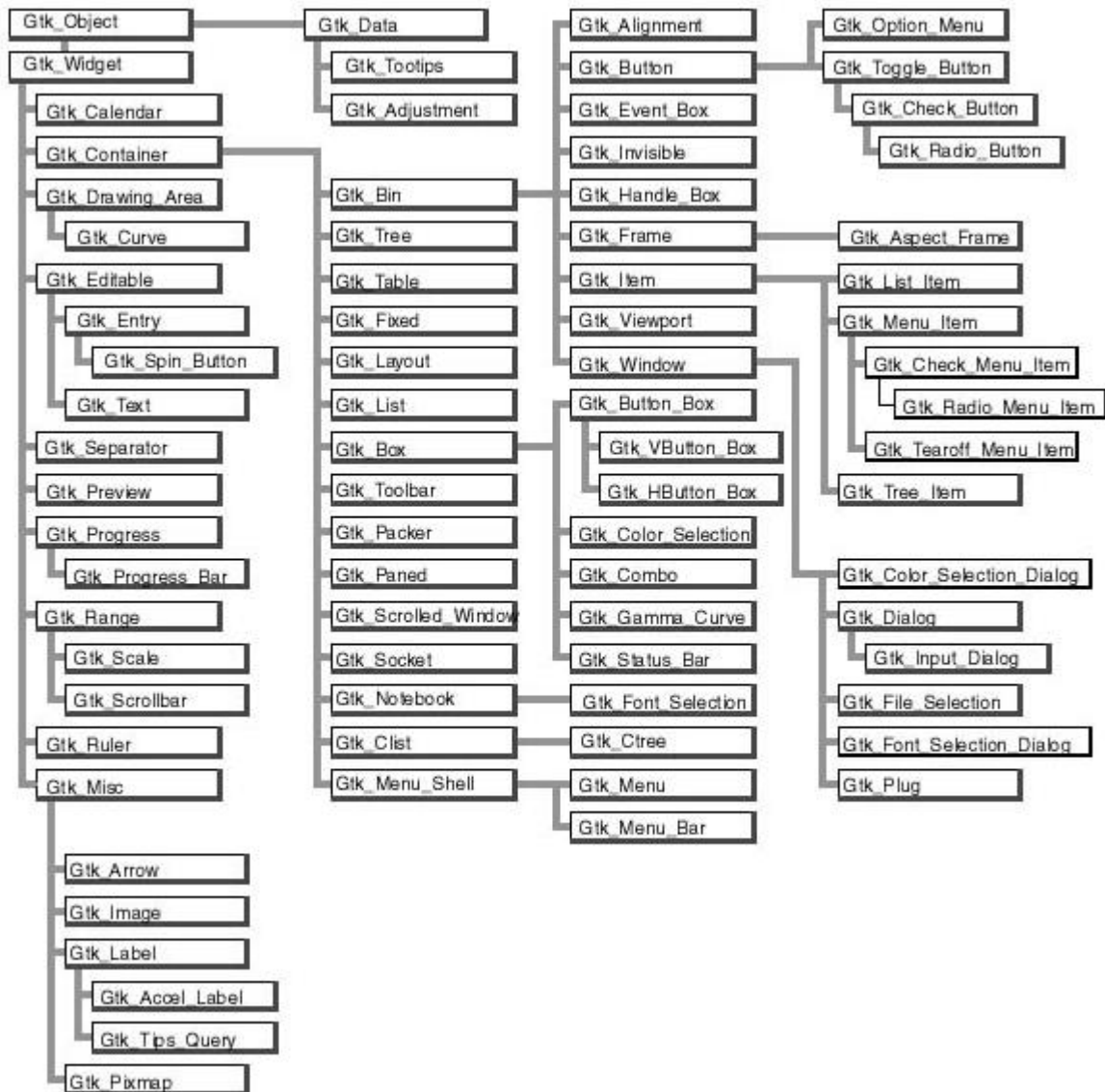
Fig. 1: Widgets Hierarchy